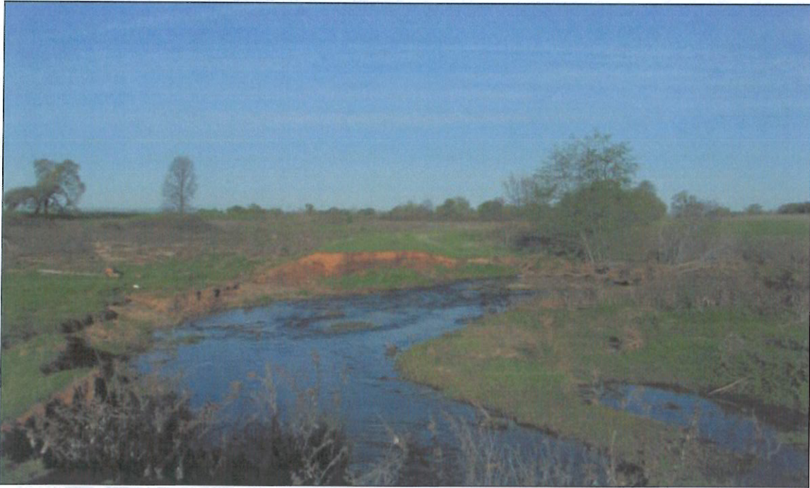
Doty Ravine on Doty Ravine Preserve