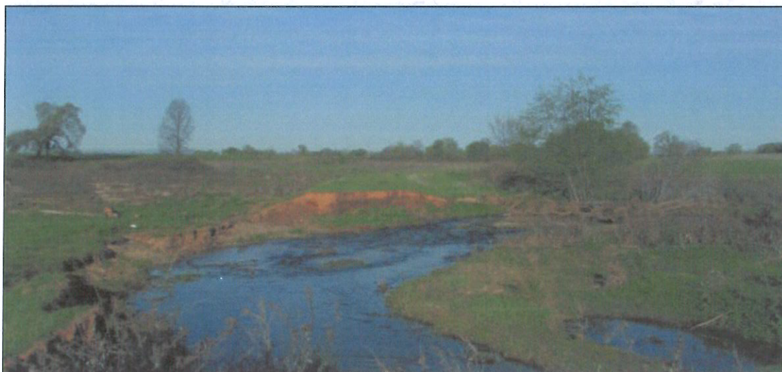
Doty Ravine on Doty Ravine Preserve