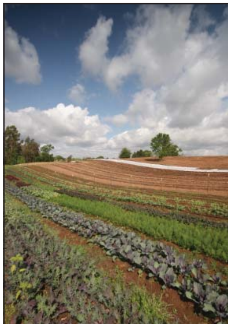
The Natural Trading Company produces organic fruits and vegetables and seasonal flowers on 40 acres.

Helen Otow's family has farmed this land since 1911. With the next two generations actively participating in the farming operation, we hope to see this land in cultivation for many decades to come. PLT is pleased to celebrate the contributions that farmers like these make to our local economy and rural quality of life.